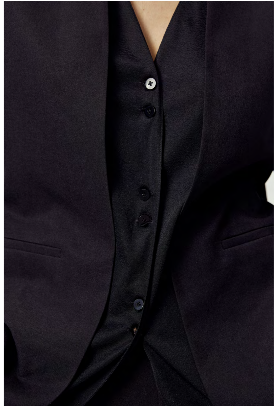
BLACK LAYERED COLLARLESS JACKET OJ0100250101 BLACK LOOSE FIT CROPPED TROUSERS OT0300250102