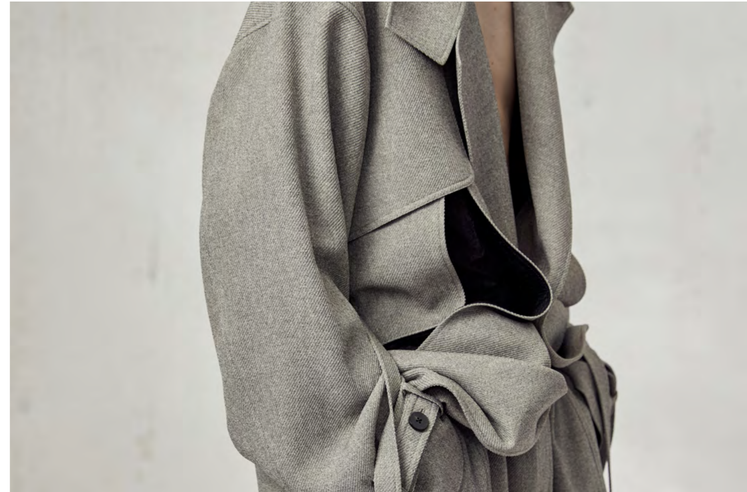
GREY TRENCH COAT WITH SLIT POCKETS 1C0200250101 GREY ELASTICIZED PATCHWORK SHORTSUSERS 1T0300250101