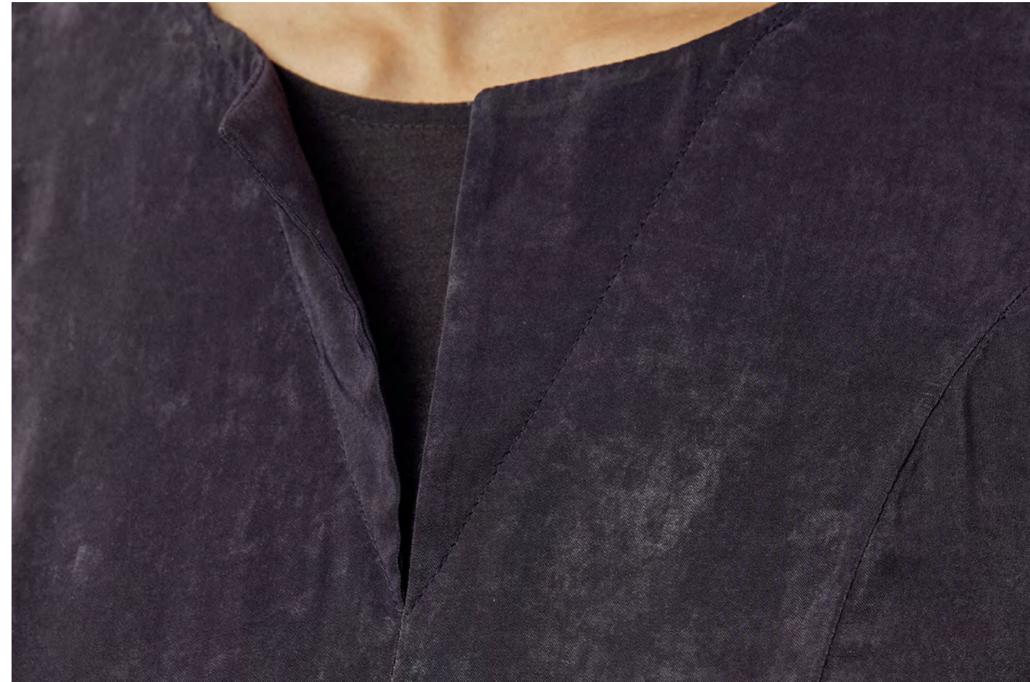
BLACK DRESS WITH NECKLINE OPENING OD0100250101