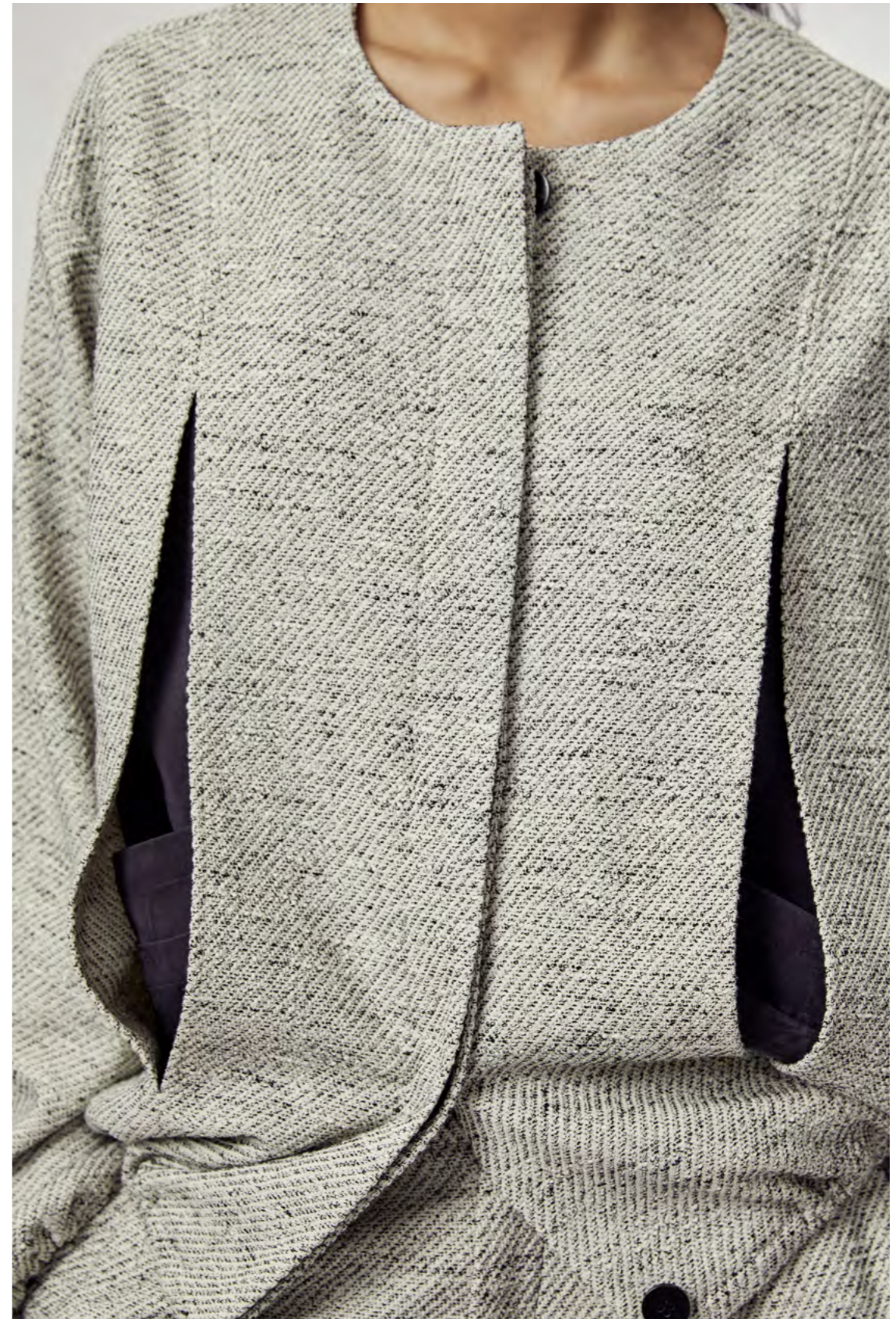
TEXTURED ROUND NECK SLIT POCKET RELAXED JACKET OJ0200250101 BLACK AND WHITE TEXTURED KNEE-OPENING STRAIGHT-LEG PANTS OT0200250102