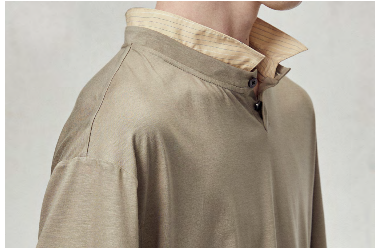
BONE SHIRT COLLAR T-SHIRT 1TS0500250101 BONE ELASTICIZED PATCHWORK SHORTS 1T0300250102