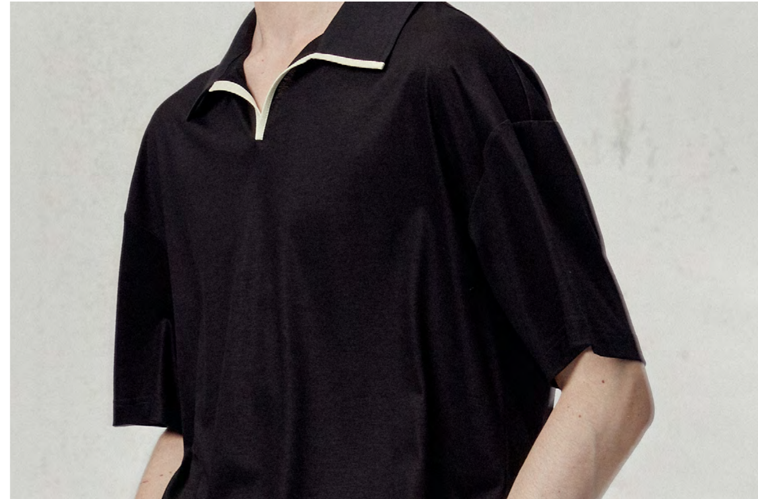
BLACK POLO WITH TRIMMED COLLAR 1TS0100250101 BLACK BELTED WIDE LEG TROUSERS 1T0200250101