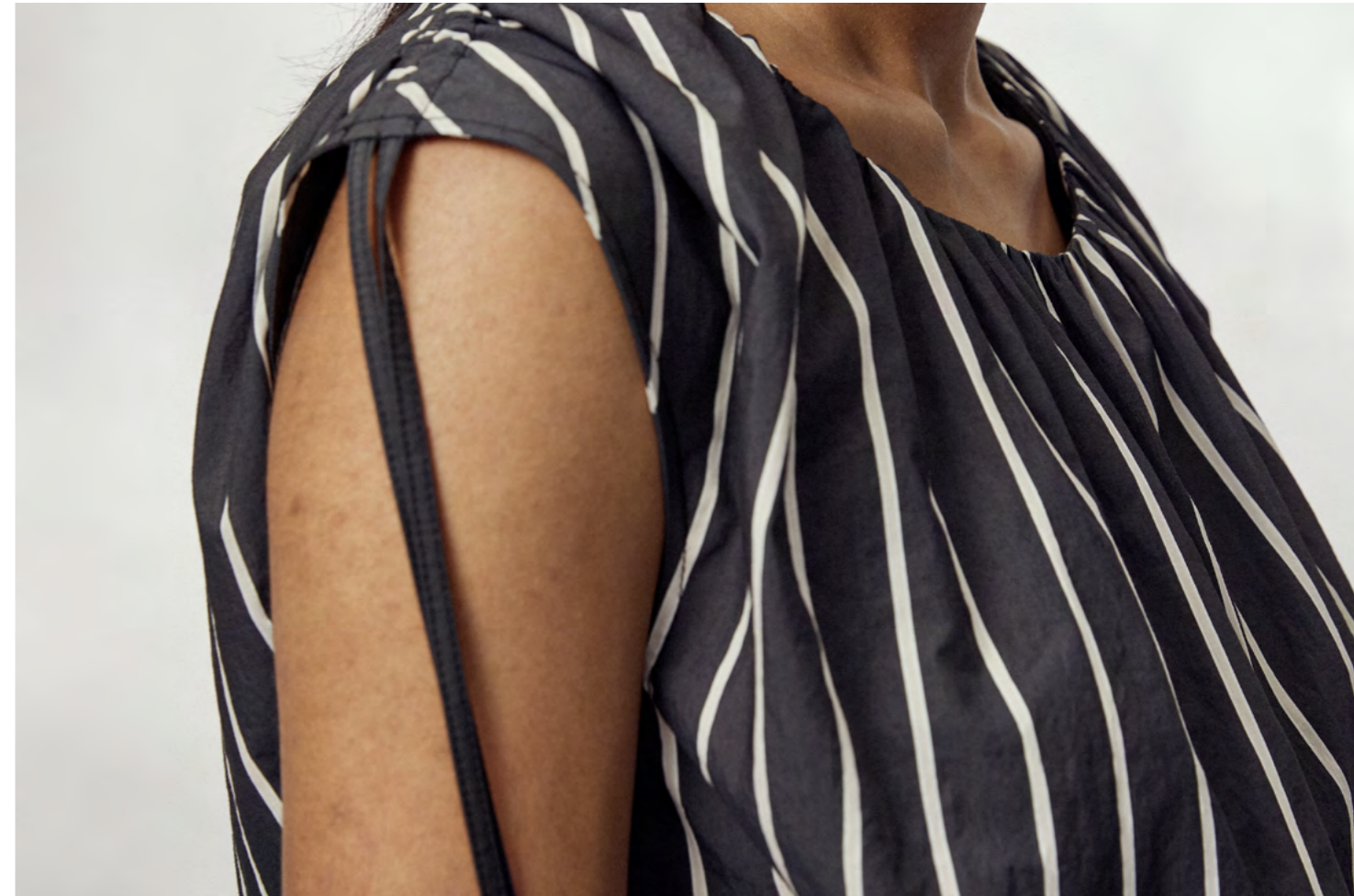
BLACK AND PINK STRIPED SHOULDER DRAWSTRING TOP 0TP0600250102 BLACK DRAWSTRING MAXI SKIRT OSK0400250102