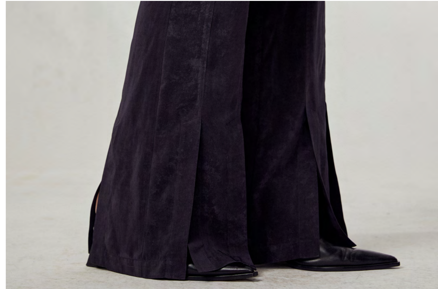
BLACK DOUBLE STRAP DRESS OD0400250101 BLACK TRIPLE SLIT FLARED TROUSERS OT0400250101