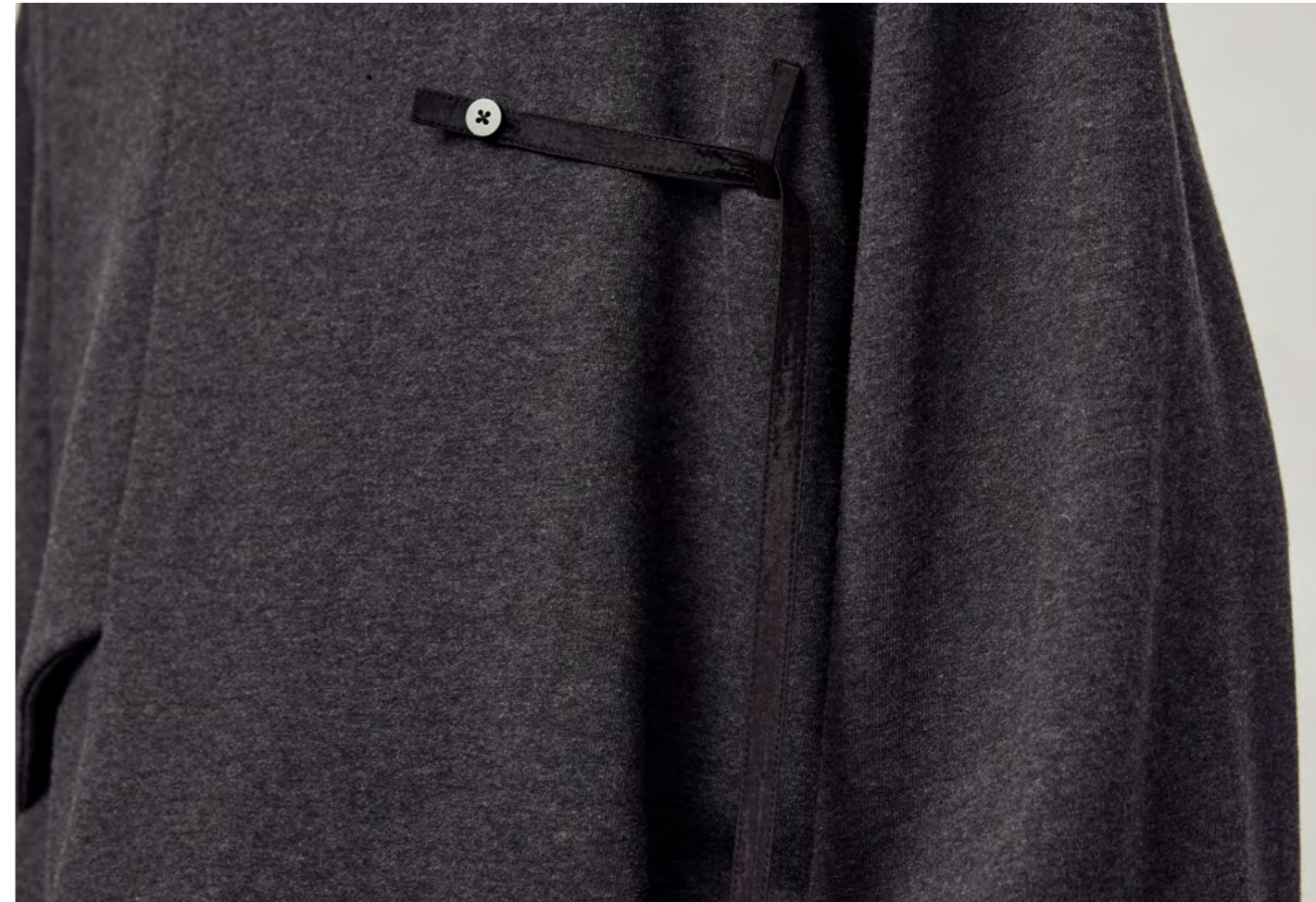
DARK GREY HOODIE WITH STRAP 1H0100250103 GREY ELASTICIZED PATCHWORK SHORTSUSERS 1T0300250101