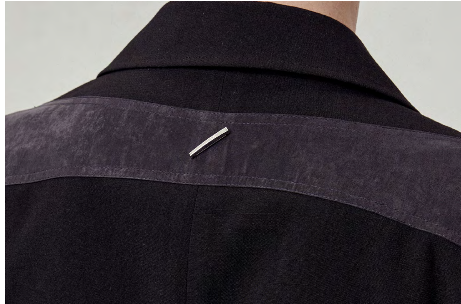
BLACK PATCHWORK LONG COAT 1C0100250101 BLACK BELTED WIDE LEG TROUSERS 1T0200250101