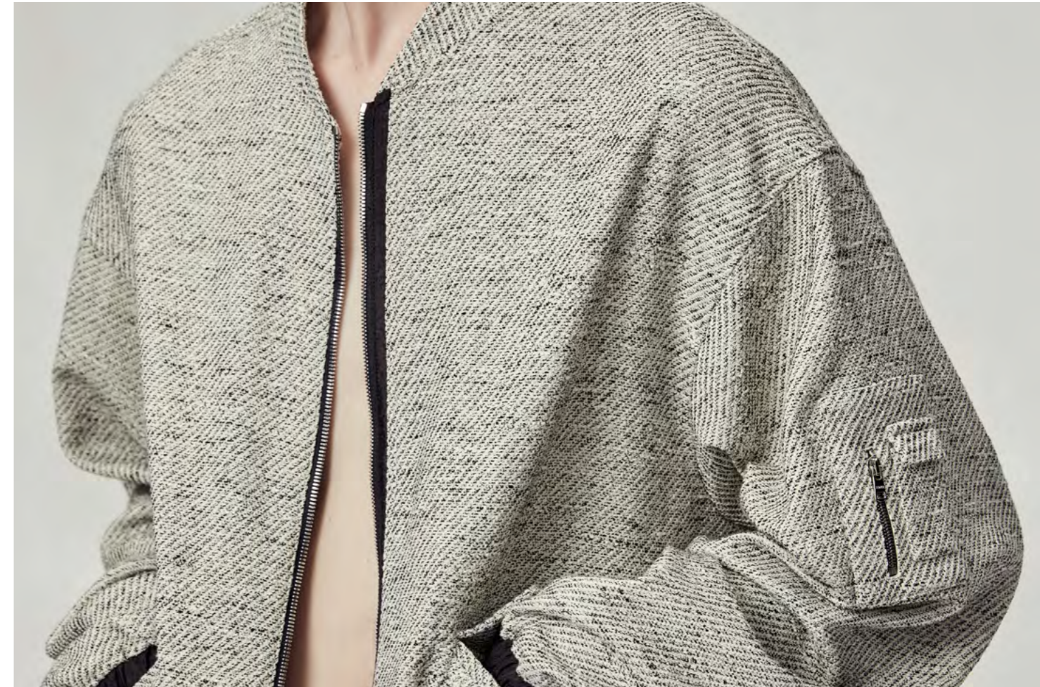
BLACK AND WHITE TEXTURED BOMBER 1J0200250101 BLACK SLIT POCKET SHORTS 1T0500250101