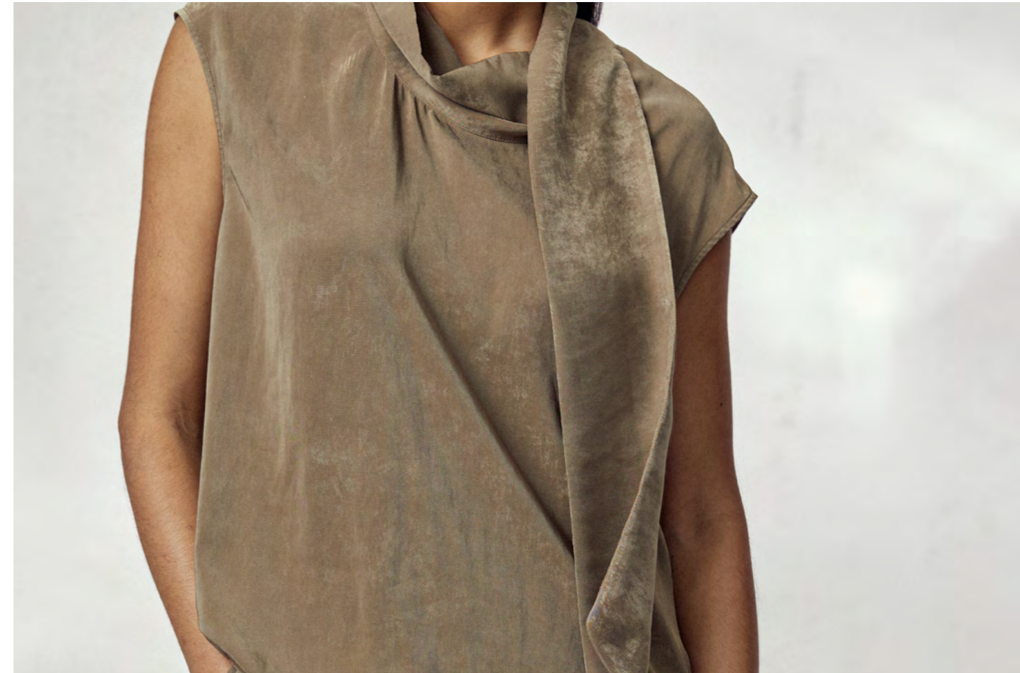
GREEN SLEEVELESS SCARF T-SHIRT 0TS0100250103 GREEN DOUBLE SPLIT UMBRELLA DRESS OSK0100250103