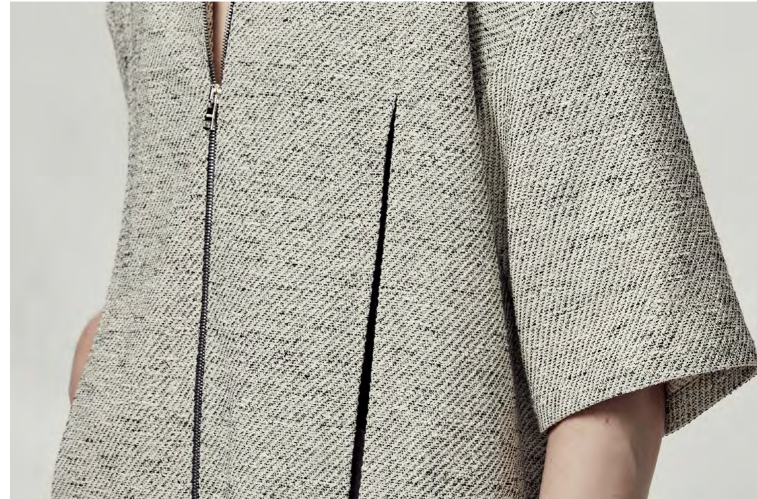
TEXTURED SLIT POCKET SHORT SLEEVE SHIRT 1S0100250101 BLACK BELTED WIDE LEG TROUSERS 1T0200250101