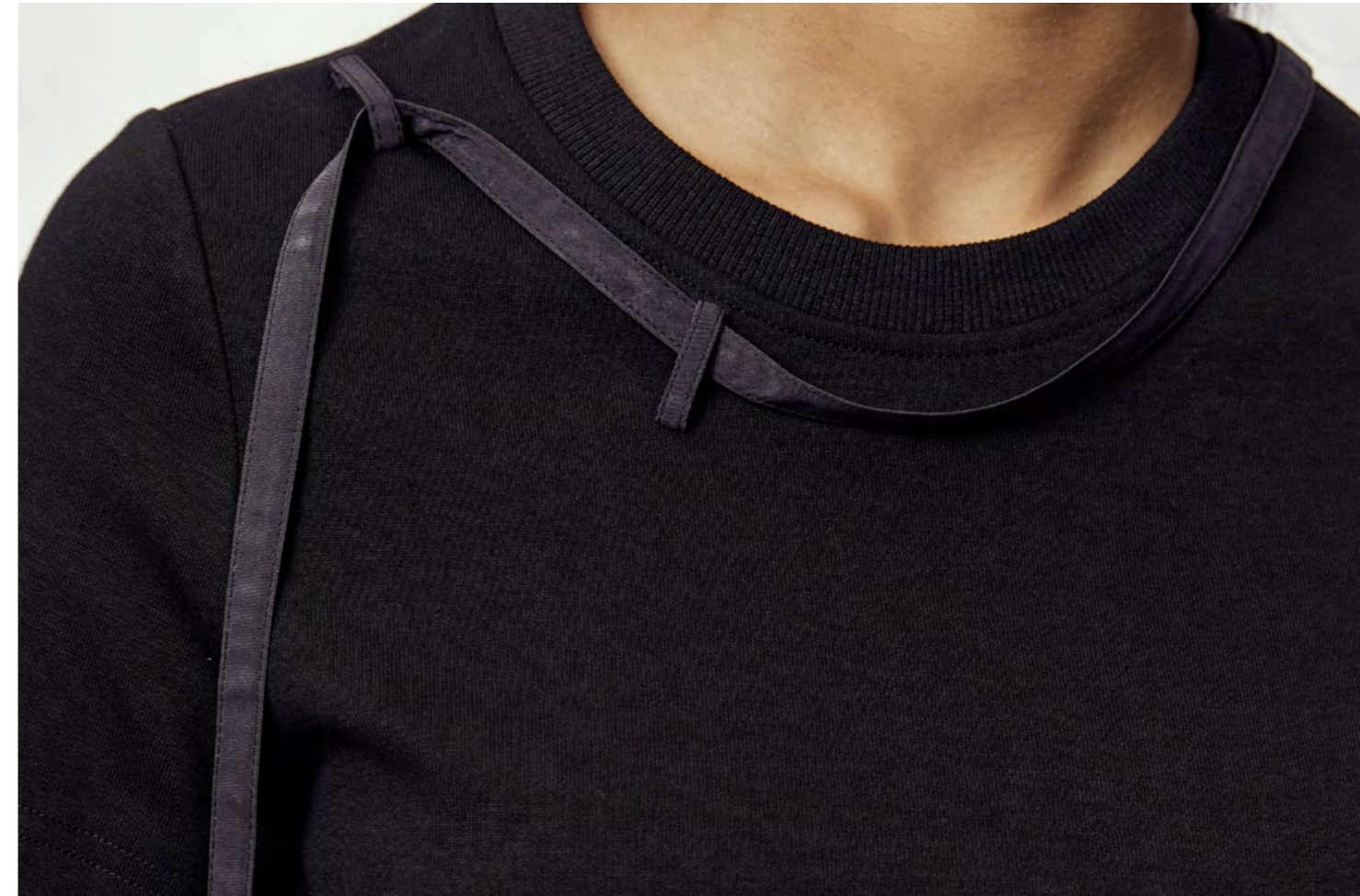
BLACK SLIM FIT T-SHIRT WITH BELT OTS0500250102 BLACK DOUBLE SPLIT UMBRELLA DRESS OSK0100250101