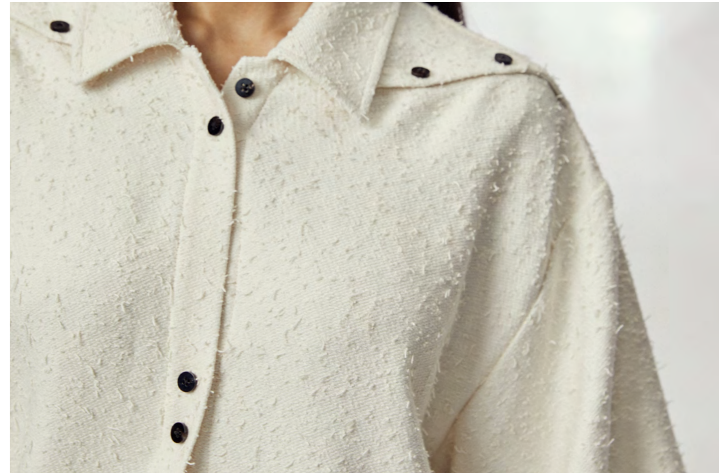
WHITE TEXTURED BUTTONED SHORT SLEEVE SHIRT 0S0400250102 WHITE TEXTURED MINI SHORTS 0T0700250103