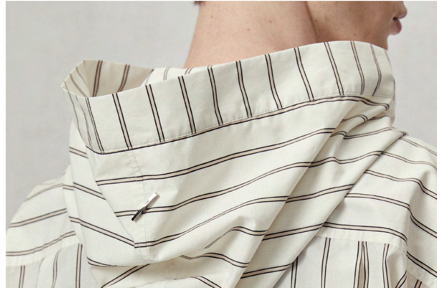
WHITE AND PINK STRIPE HOODED SHIRT 1S0200250101 BONE ELASTICIZED PATCHWORK SHORTS 1T0300250102