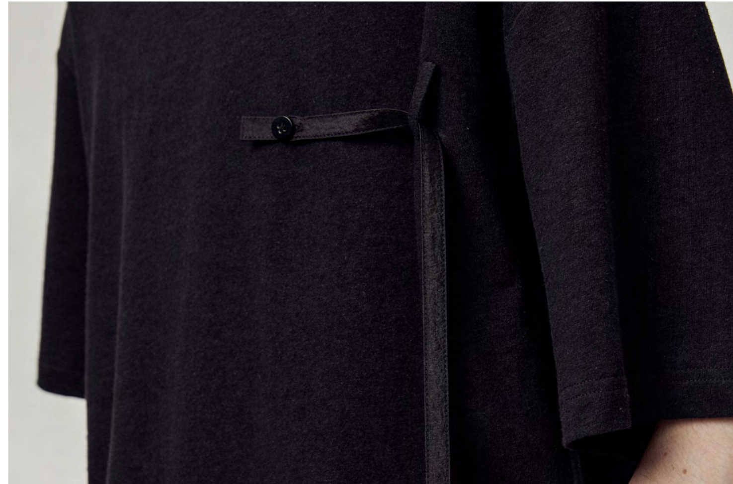
BLACK BELTED T-SHIRT 1TS0700250102 BLACK SLIT POCKET SHORTS 1T0500250101