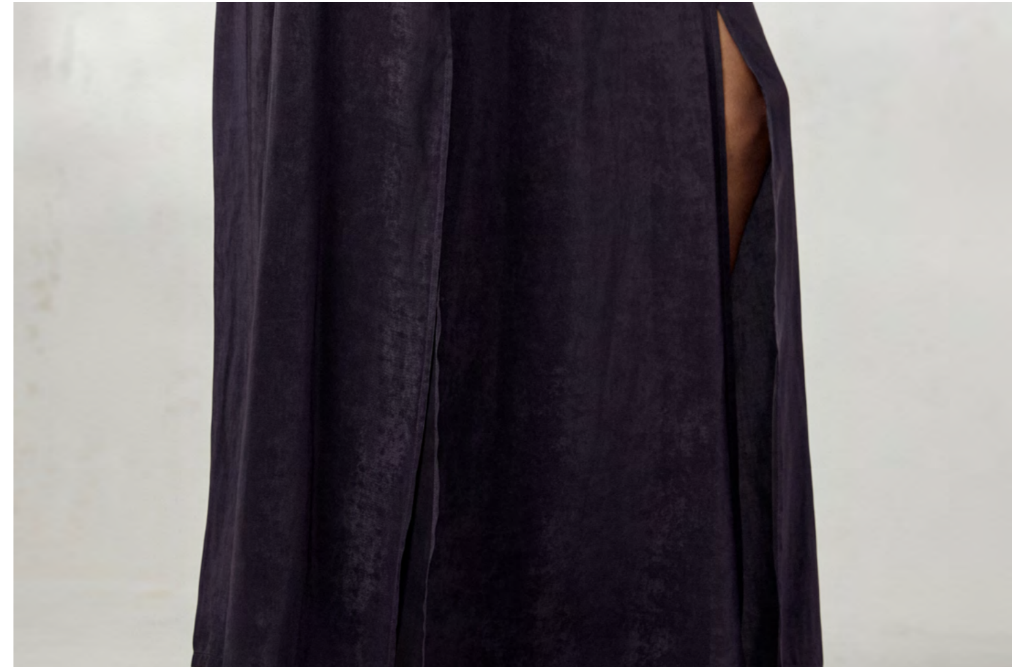
WHITE AND BLUE STRIPE SLEEVELESS SHIRT OS0300250101 BLACK DOUBLE SPLIT UMBRELLA DRESS OSK0100250101