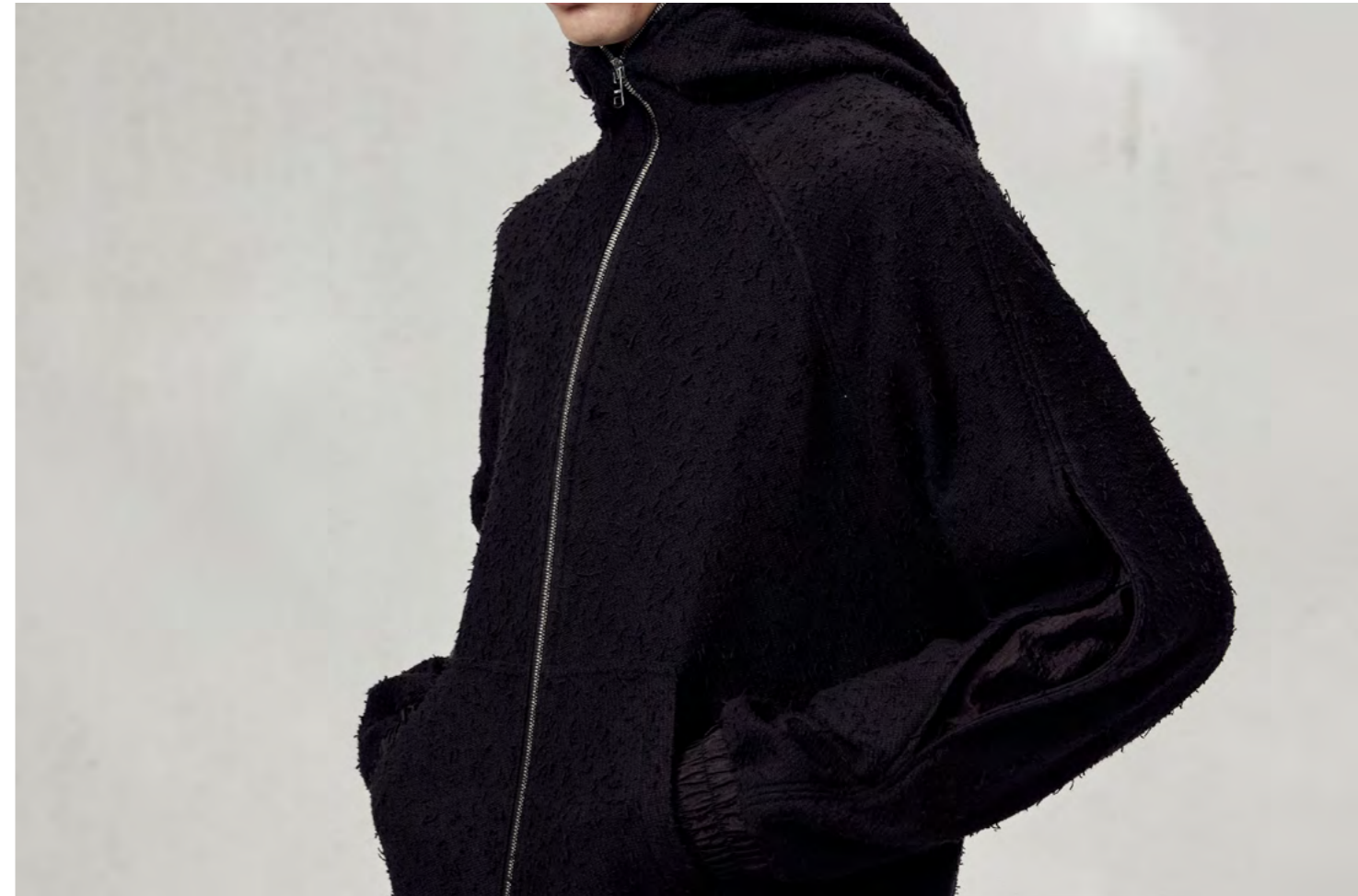
BLACK DOUBLE LAYER RAGLAN SLEEVE HOODED JACKET 1J0300250102 BLACK BELTED WIDE LEG TROUSERS 1T0200250101